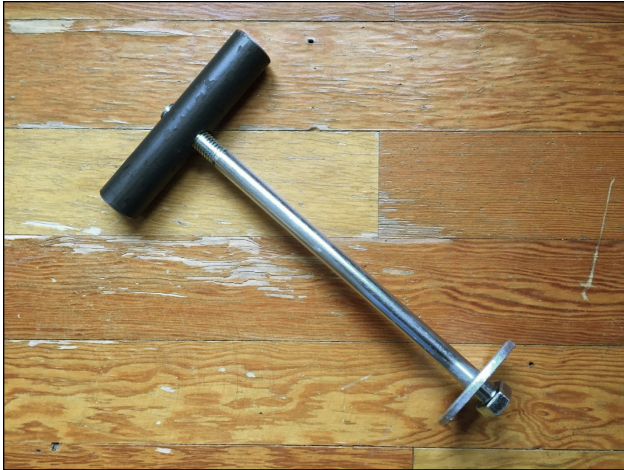
Figure 2. Prototype panel connector.

A panel connection system is being developed and tested that is similar in design (albeit much more heavy duty) to that used in the furniture industry (Fig. 2). These doweled fasteners would be simple to install and allow the butting of panels with little field modification. Full-size lateral load tests will be performed on an assembled safe room (8 by 8 by 8 ft in size) to verify the integrity of the developed connection system and lateral wind pressure resistance of the shelters.